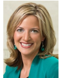
Jocelyn Benson Former Dean of Wayne State Law School