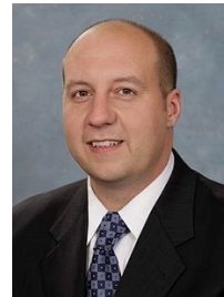
Curtis Hertel Jr Senator from Michigan's 23rd Senate District